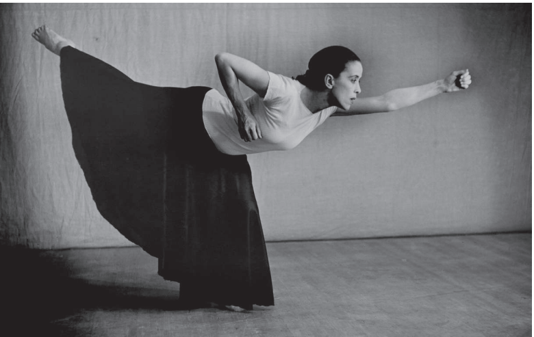
Photo of Martha Graham in Immediate Tragedy

During her long and illustrious career, Graham created 181 dance compositions. During the Bicentennial she was granted the United States' highest civilian honor, The Medal of Freedom. In 1998, TIME Magazine named her the "Dancer of the Century." The first dancer to perform at the White House and to act as a cultural ambassador abroad, she captured the spirit of a nation. "No artist is ahead of his time," she said. "He is his time. It is just that the others are behind the time."