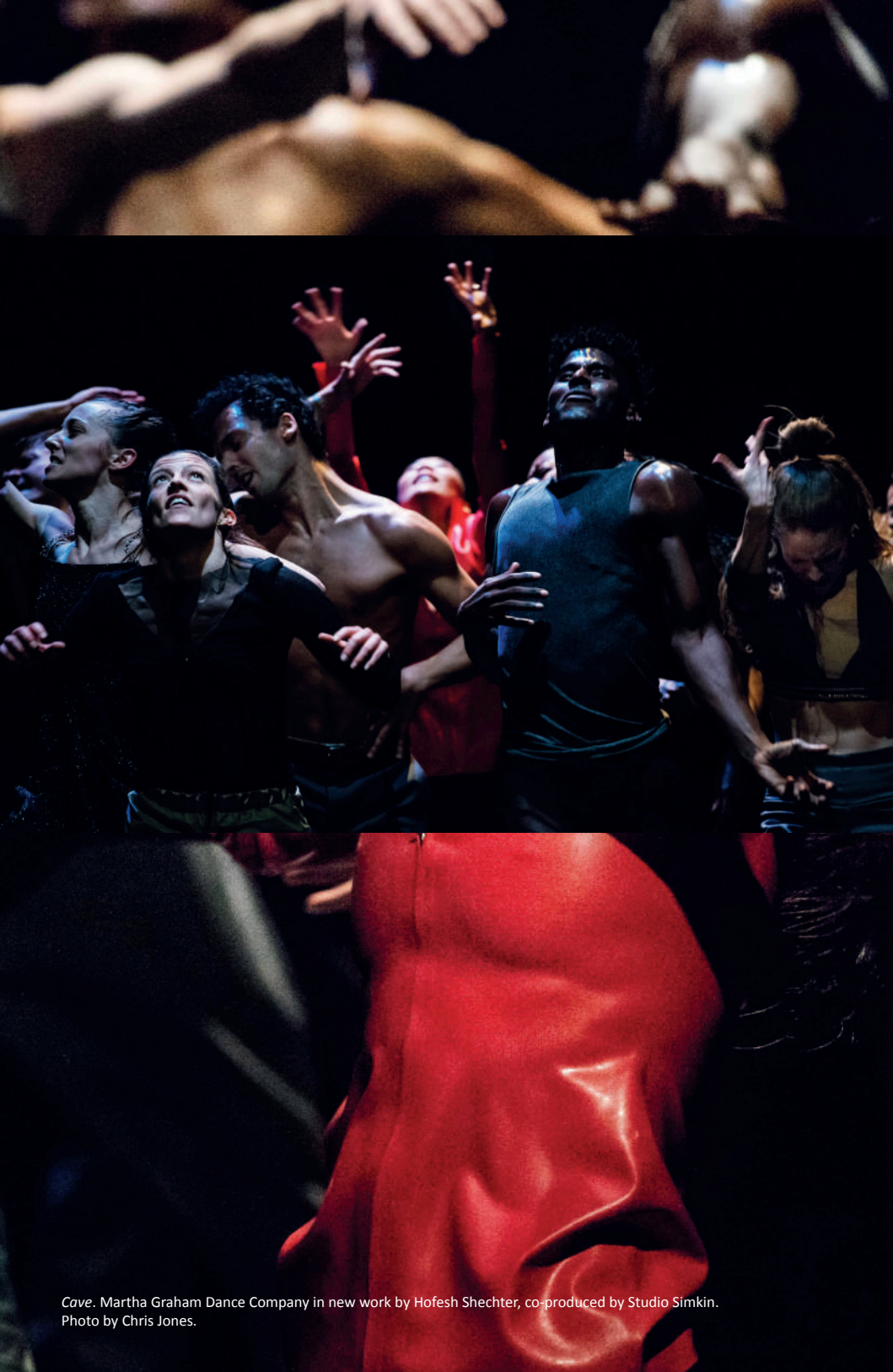
Cave. Martha Graham Dance Company in new work by Hofesh Shechter, co-produced by Studio Simkin.